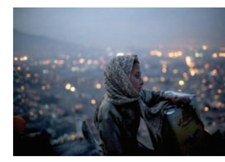
Photo by Jared Moossy from "Leaves of Grass" An Afghan girl rides her donkey down to the well at the bottom of the mountain to fetch water. Kabul, Afghanistan

The human rights principles of participation, transparency, accountability and redress, must also be integrated into policy responses. A human rights approach requires a focus not only with the consequences of policies and programs, but also on the processes by which those policies are adopted. This means that, in the crisis response, programs must be designed, implemented and evaluated in a manner that ensures transparency, full participation (including of women) and institutes mechanisms for accountability and redress (OHCHR, 2006).