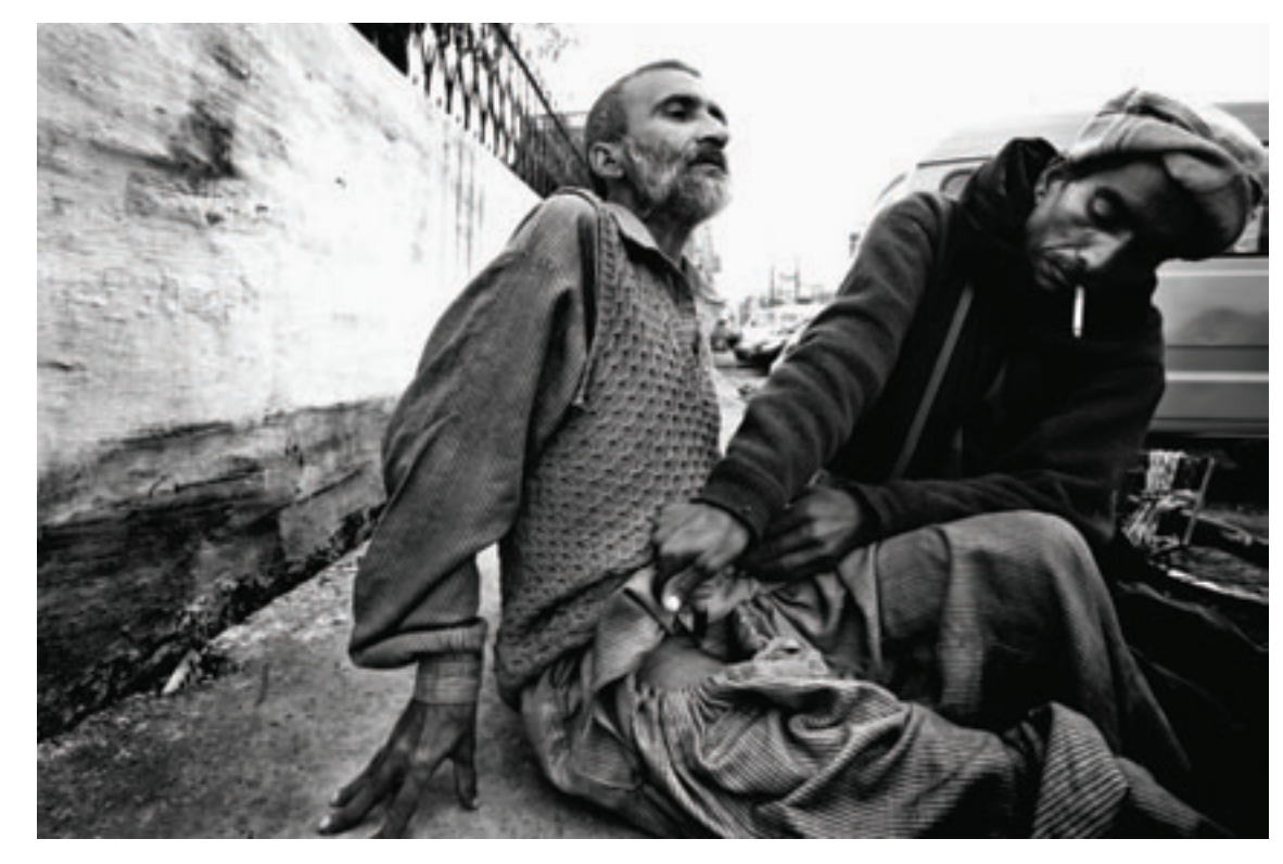
from "Behind the War on Terror" A heroin addict injected by his friend on the roadside in the early morning.