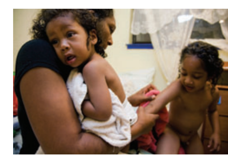
from "Selena" Selena takes a moment to bond with her family.

The economic and financial crisis is a global crisis that requires global solutions. It is a crisis generated in the global north, yet having disproportionate impacts on the global south. Decision-making on global policy responses and new regulatory frameworks cannot, therefore, remain in powerful, self-selected decision-making forums such as the G8 or the G20, but should be carried out in multilateral forums such as the