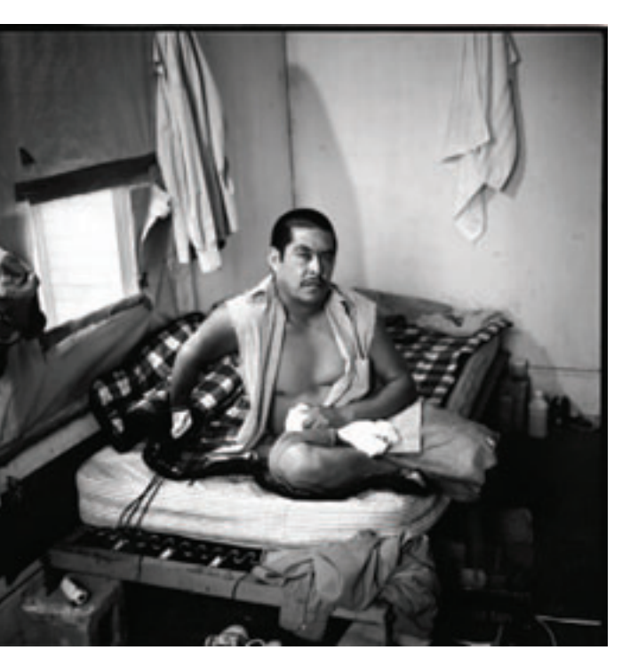
from "Slave-Like Conditions of Tobacco Leaf Harvesters in North Carolina" Portrait of a tobacco leaf harvester on his bed on a Sunday in crowded, dilapidated house he shares with other workers in North Carolina.

lions more slum dwellers will face lack of access to clean water and sanitation, and increased insecurity of tenure (UN Habitat, 2008). The crisis has also had a direct impact on children's right to education, as children are pulled out of work to help support their families, though children who leave school early will never catch up (World Bank, 2009).