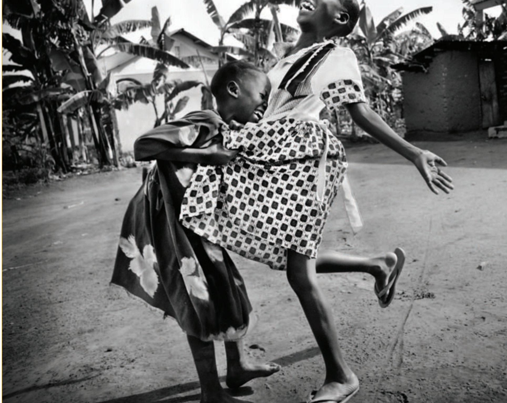
from "Net Gains" Girls Laughing, Rakai Village, Uganda